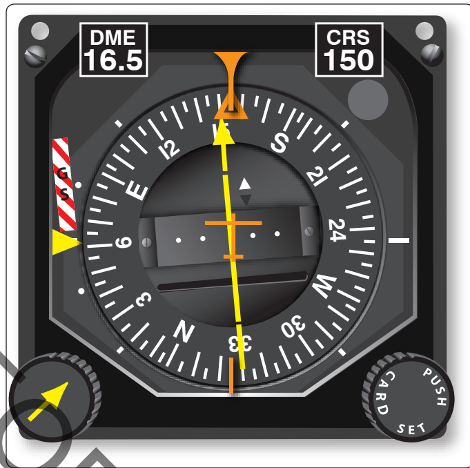
FIGURE 114.—Aircraft Course and DME Indicator.