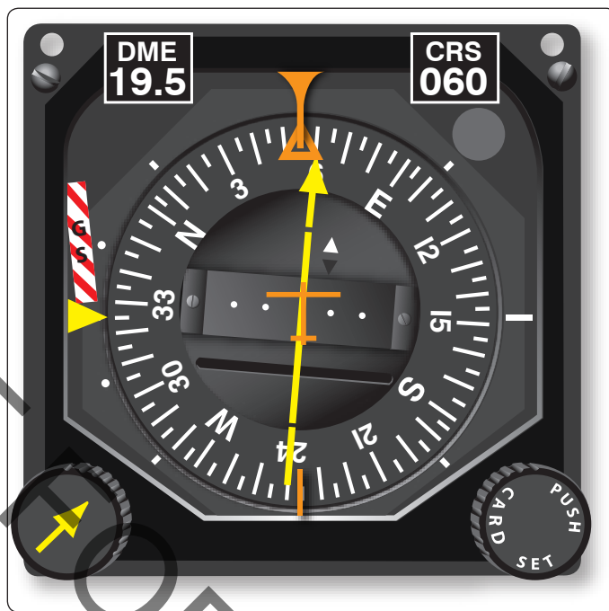
FIGURE 113.— Aircraft Course and DME Indicator.